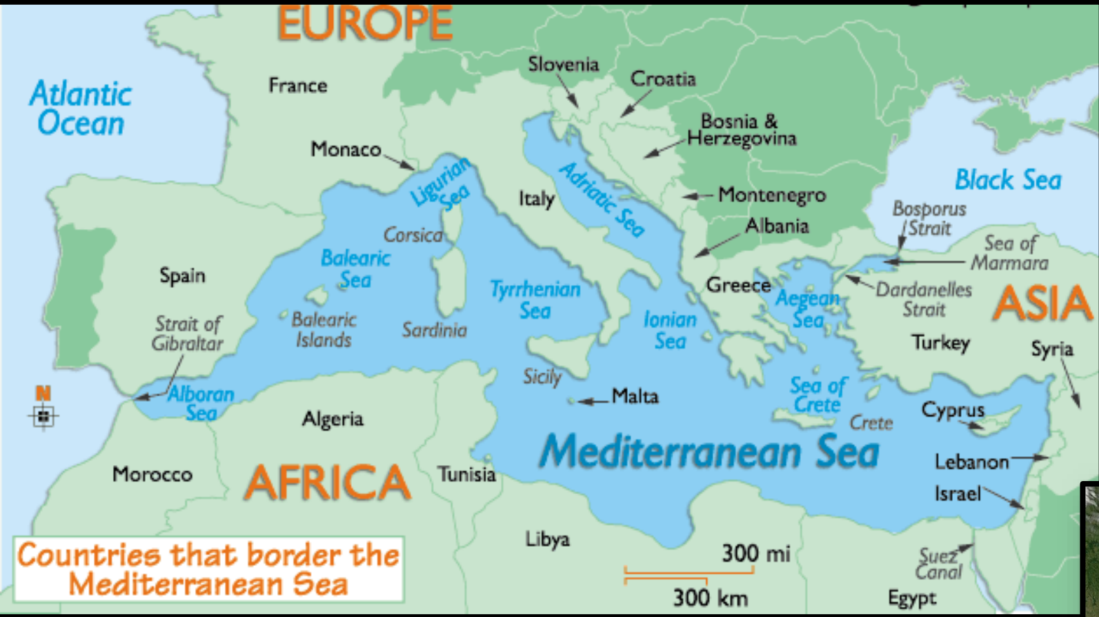
Countries that border the Mediterranean Sea