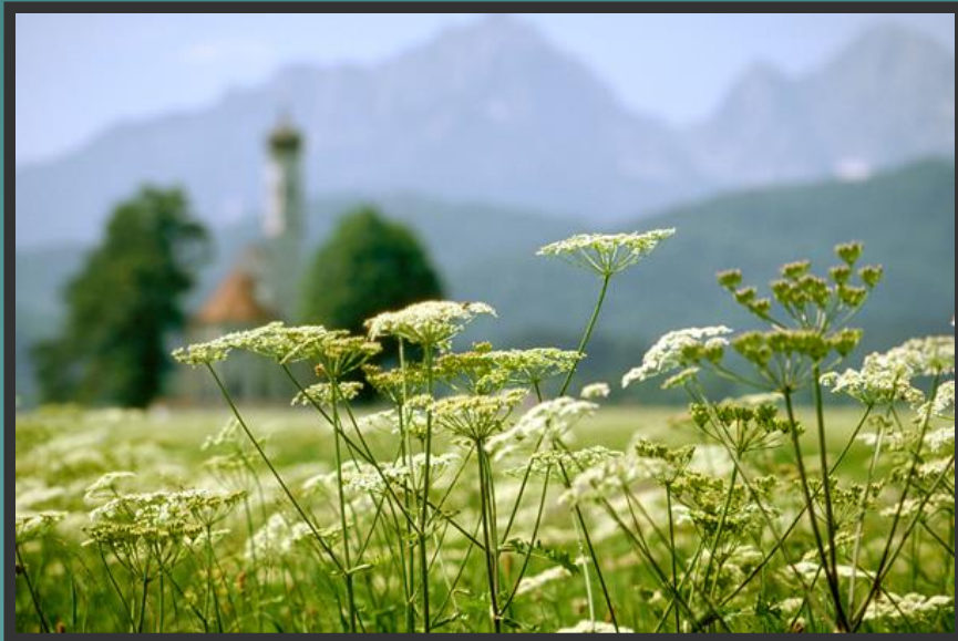
Spring in Germany

Germany has a moderate climate with warm, mild summers and cool winters. Extreme weather conditions do not occur very often.