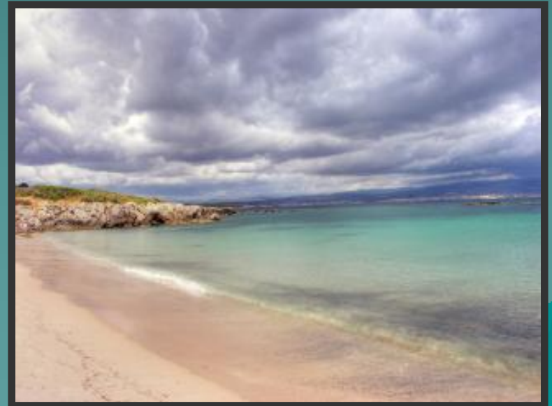
Summer in Italy

Mountains cover about 70 percent of the country.